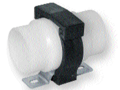
PVDF fixed point fitting shown with clip

"Fixed point fittings" are manufactured from Polypropylene, Polyethylene and PVDF. They are designed to accommodate a pipe bracket that can be securely fixed to a structural support. It is also possible to fabricate this type of fitting in PVC-U and PVC-C using standard pipe sockets (see drawing).